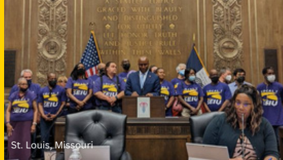
St. Louis, Missouri