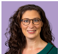
Governor of Michigan Gretchen Whitmer

Unions stand by members to improve conditions and compensation for hard-working individuals and their families. Unions connect members to a network of support that extends across trades—strengthening the position of all union members as they advocate for themselves.